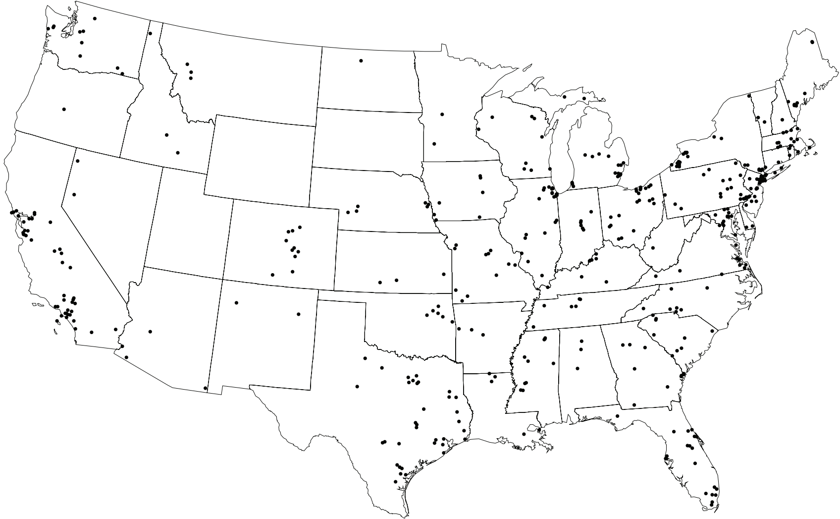
FIGURE 3-1 Schools included in 1 Year's Data Collection 8th, 10th, and 12th Grades

Source. The Monitoring the Future study, University of Michigan Note. One dot equals one school.